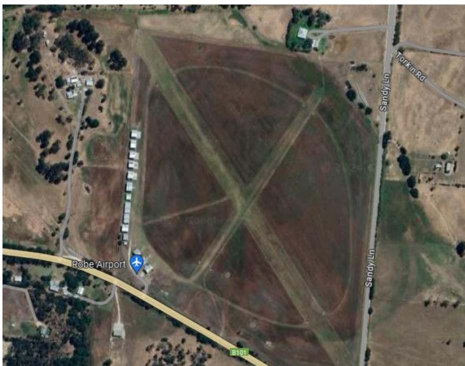
Map – Robe Aerodrome

There are currently 17 hangars located in the Robe Airfield. The Airfield is an Aeroplane Landing Area (ALA) and caters for light aircrafts. There is possible capacity for two hangars to be constructed.