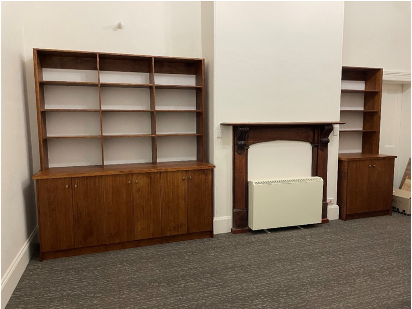
Photo: the beautiful cabinetry now installed in the Kathleen Brown Room.

It is a very exciting time for the Kathleen Brown Room and the Robe History Group and these developments will have a significant impact on sorting the collection and what the room will look like.