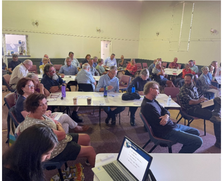
Photo: Community Planning Day

The following day was an opportunity for the community to get involved, with a community planning day on Thursday 7th March 2024. The session, which was well attended, was primarily hands-on, with facilitators exploring key themes and priorities. Not an exhaustive list by any means, some of issues raised during the group sessions were: