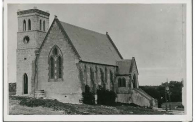
ST PETERS' CHURCH

Call out to any interested community members who would like to chat about what the future looks like for the church, kirk and grounds.