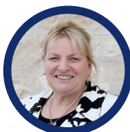
MAYOR LISA RUFFELL

mayorruffell@robe.sa.gov.au 0474 581 595