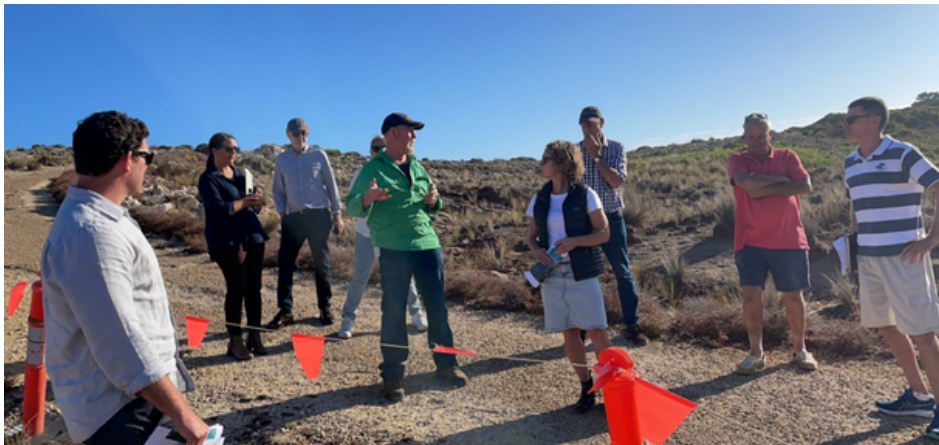
Photo: Council members at the blow hole site considering trail diversion options

We would like to thank Mahalia, Robe RSL and Limestone Coast Boat Tours for their support and assistance which ensured the tour was a success.